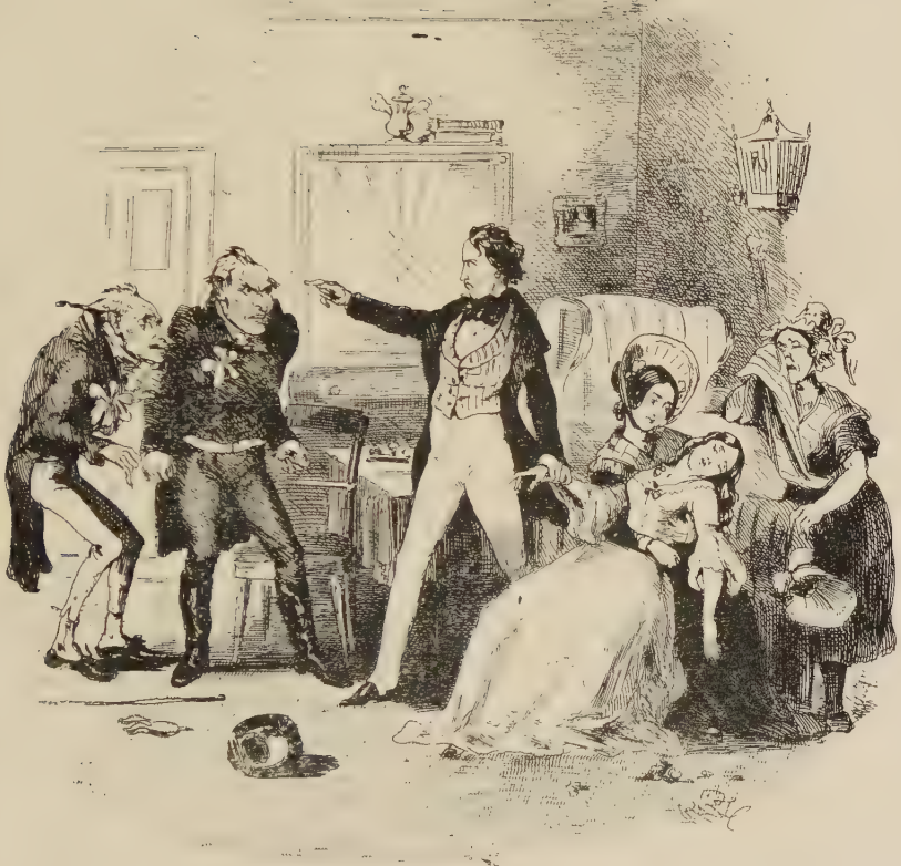
NICHOLAS CONGRATULATED ARTHUR GRIDE ON HIS WEDDING MORNING.